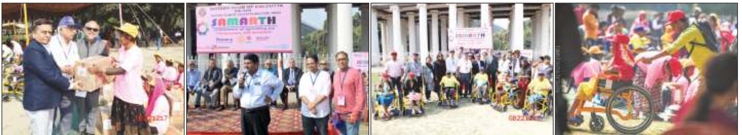
[Reported by Co Editor AB4]