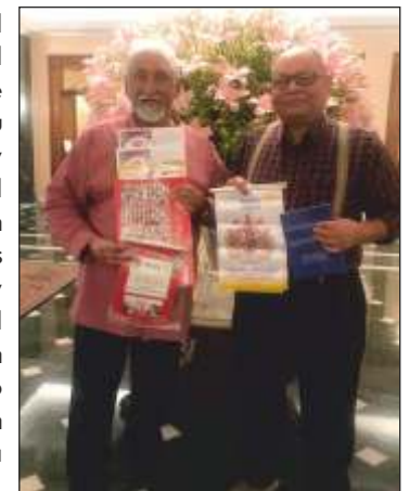
[Reported by AB4, Co Editor]